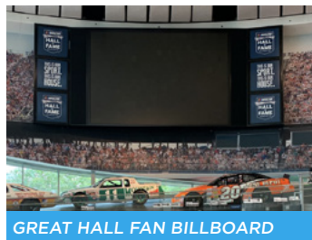
GREAT HALL FAN BILLBOARD