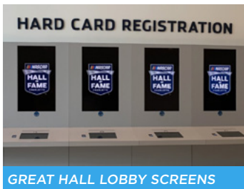
GREAT HALL LOBBY SCREENS

Gain great visibility at the popular simulators with a branded pop-up banner by the entrance to the cars. Click for video.